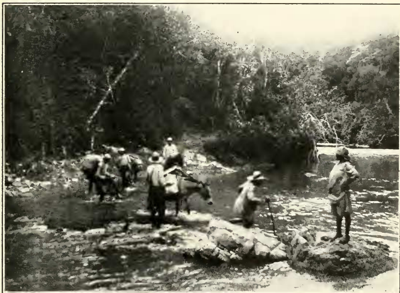
CROSSING THE RIVIÈRE DES ROSEAUX. Below Bois Lacombe, Haiti, April 10, 1931.